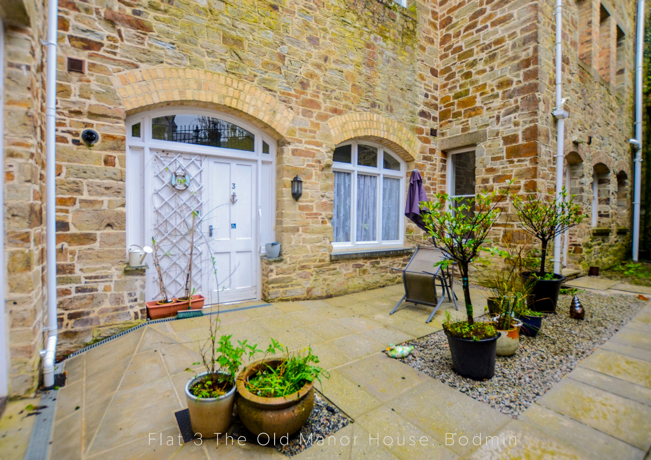
Flat 3 The Old Manor House, Bodmin