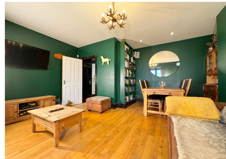
Castle Terrace, Bridge of Weir