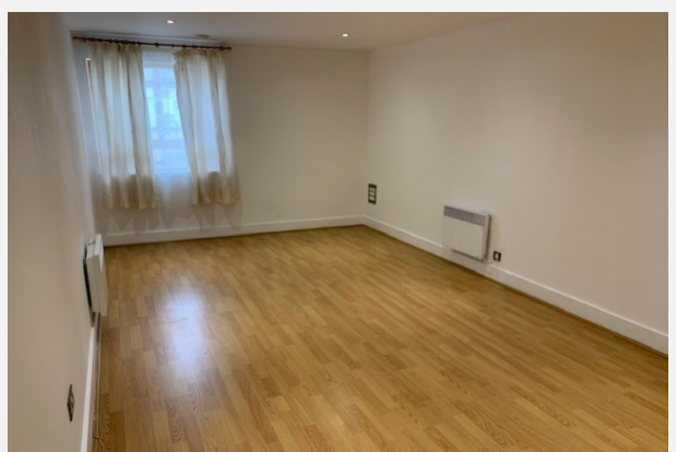
College Street £112,500 1 Bedrooms, 1 Bathrooms, 1 Receptions