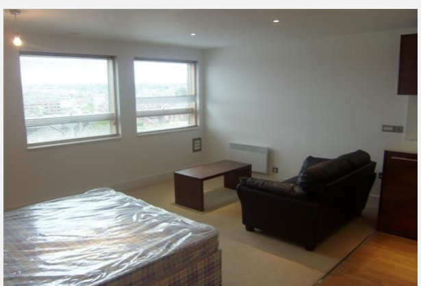
Foundry, The Mill £82,995 O Bedrooms, 1 Bathrooms, 1 Receptions