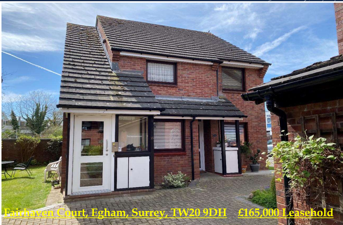
Fairhaven Court, Egham, Surrey, TW20 9DH £165,000 Leasehold