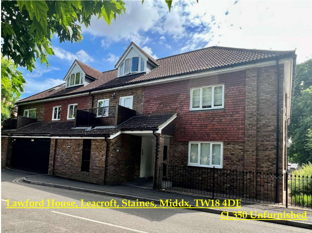
Lawford House, Leacroft, Staines, Middx, TW18 4DE