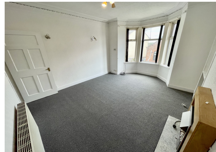
13 Townend Street, Dalry