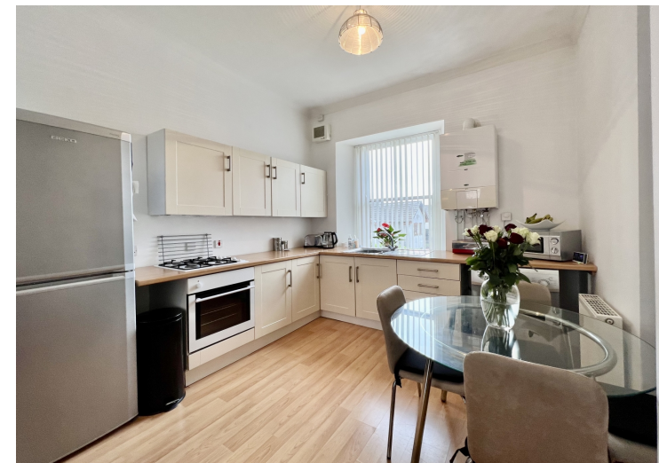
Main Street, Dalry