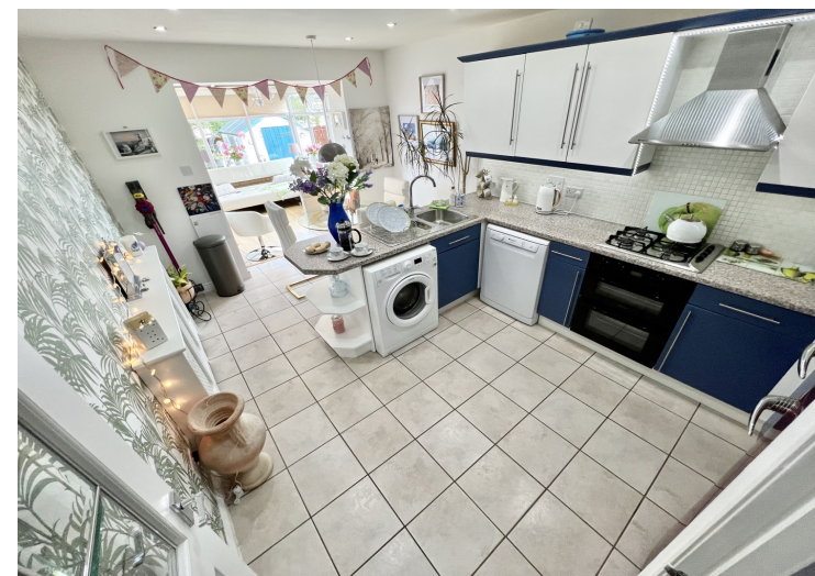
11 Wilson Wynd, Dalry