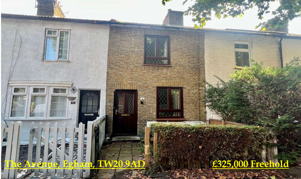
The Avenue, Egham, TW20 9AD