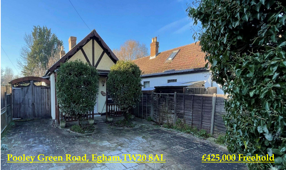
Pooley Green Road, Egham, TW20 8AL