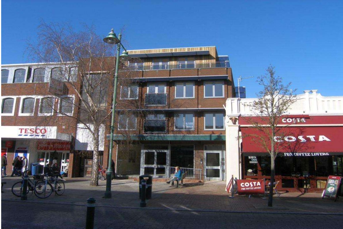
High Street, Surrey, TW20 9EY