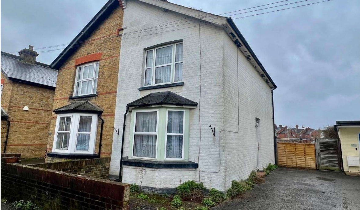
North Street, Egham, Surrey, TW20 9RP