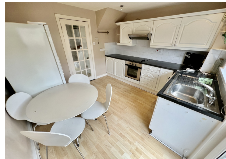
4 Ellon Drive, Linwood, Paisley