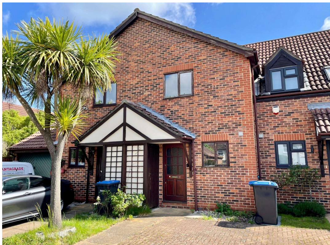
Herndon Close, Egham, TW20 9DE OIEO £325,000 Freehold