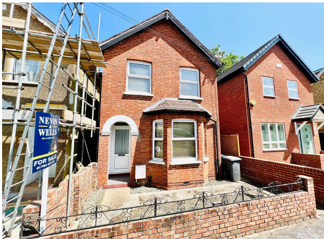
Glebe Road, Egham, Surrey, TW20 8BT