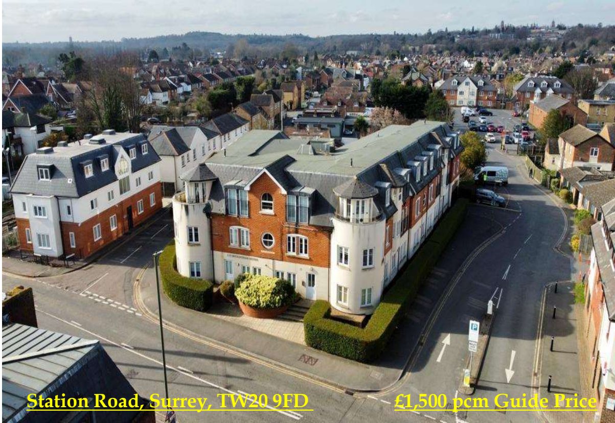
Station Road, Surrey, TW20 9FD