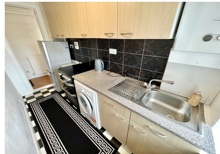
1/1, 10 Janefield Place, Beith