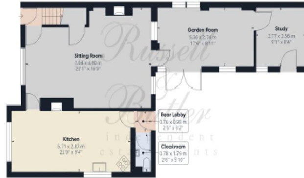
Floor 0 Building 1