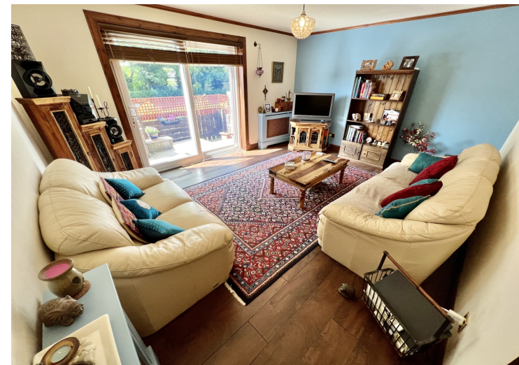
9 Bellmans Close, Beith