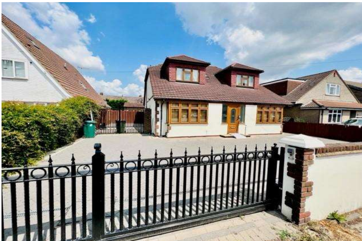
Staines Road West, Ashford, TW15 1RB