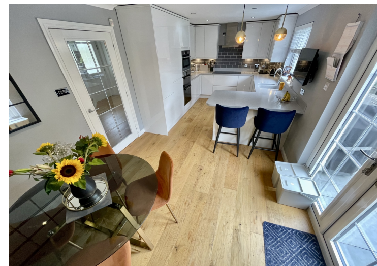
15 Grahamfield Place, Beith