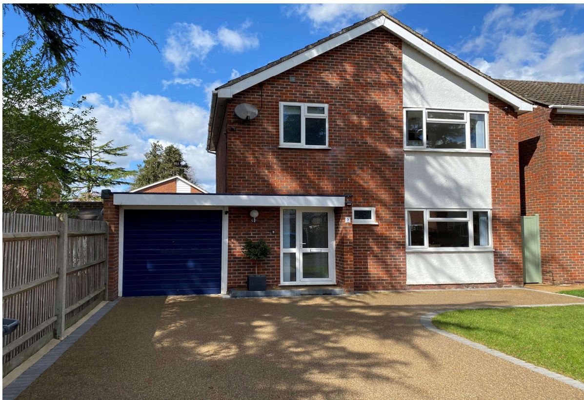
Boscombe Close, Egham, TW20 8LX