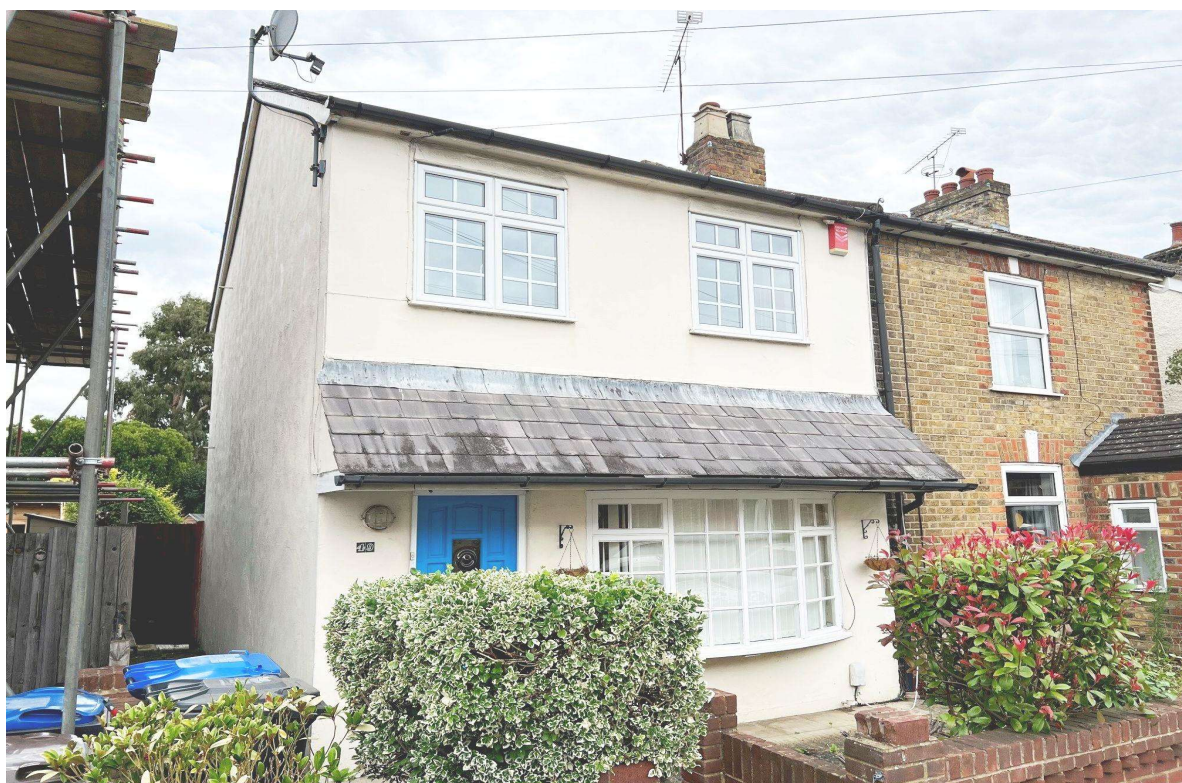
Hummer Road, Surrey, TW20 9BS