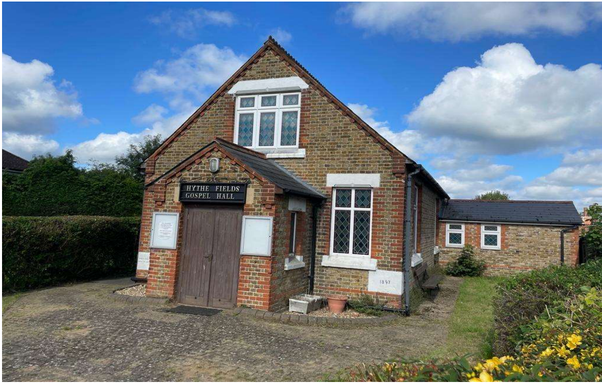
Gospel Hall, Egham, Surrey, TW20 8HA