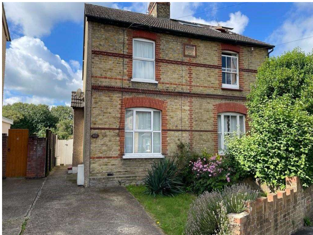
Wendover Road, Staines, TW18 3DE