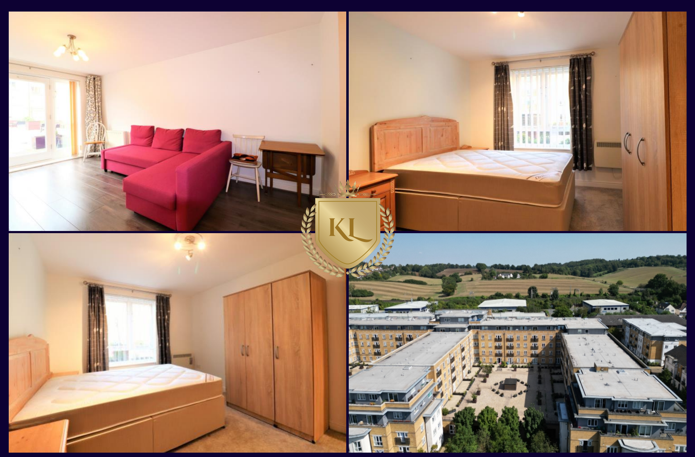
Kings Langley Estates wishes to inform prospective buyers and tenants that these particulars are a guide and act as information only. All our details are given in good faith and believed to be correct at the time of printing but they don't form part of an offer or contract. No employee of the company has authority to make or give and representation or warranty in relation to this property. All fixtures and fittings, whether fitted or not are deemed removable by the vendor unless stated otherwise and room sizes are measured between internal wall surfaces, including furnishings.