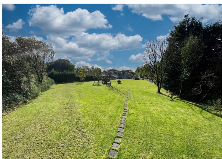
54 Kirkland Road, Glengarnock