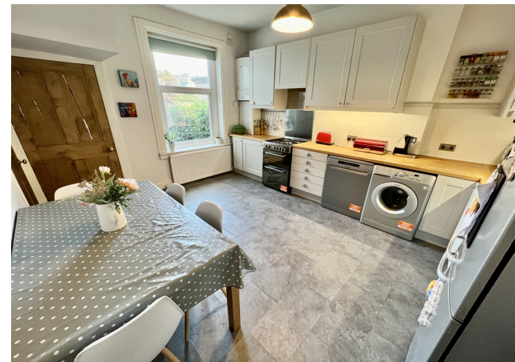
6 Harvey Cottages Harvey Terrace, Lochwinnoch