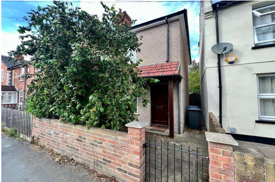
Rusham Road, Egham, TW20 9LP