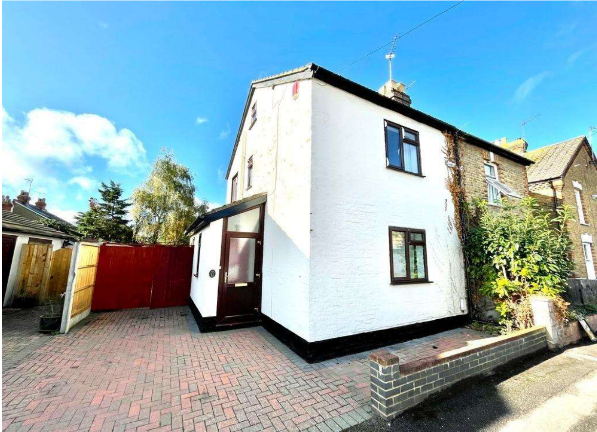
Kings Road, Egham, Surrey, TW20 9BN