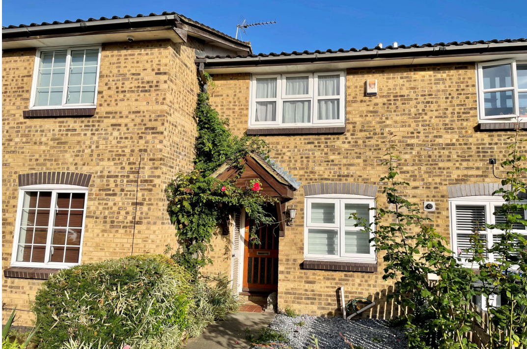
Derwent Road, Egham, Surrey, TW20 8JP £365,000 Freehold