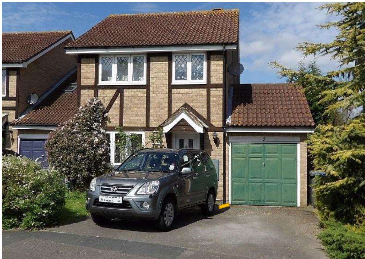
Wesley Drive, Egham, TW20 9JA