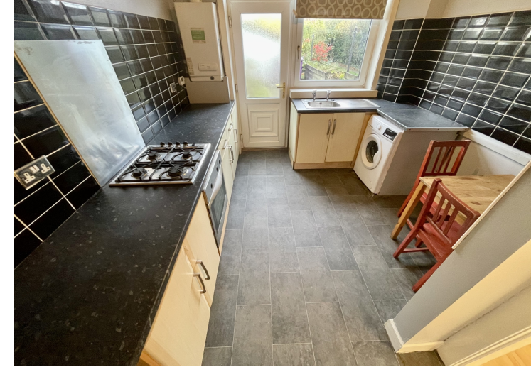
85a Nelson Street, Largs