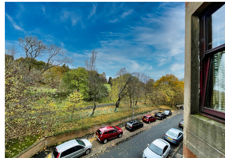
Benview Street, Glasgow