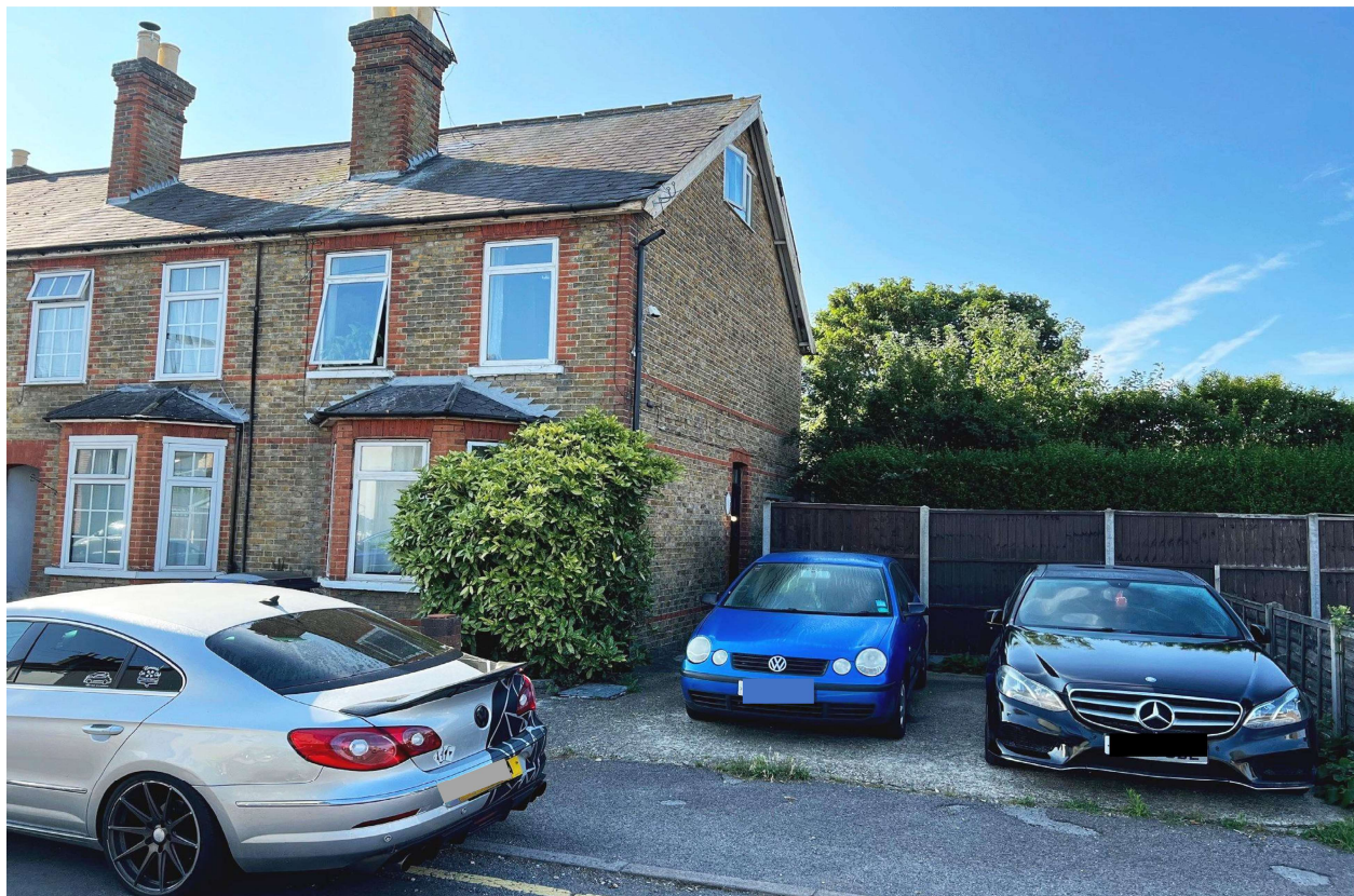
Crown Street, Egham, TW20 9BZ