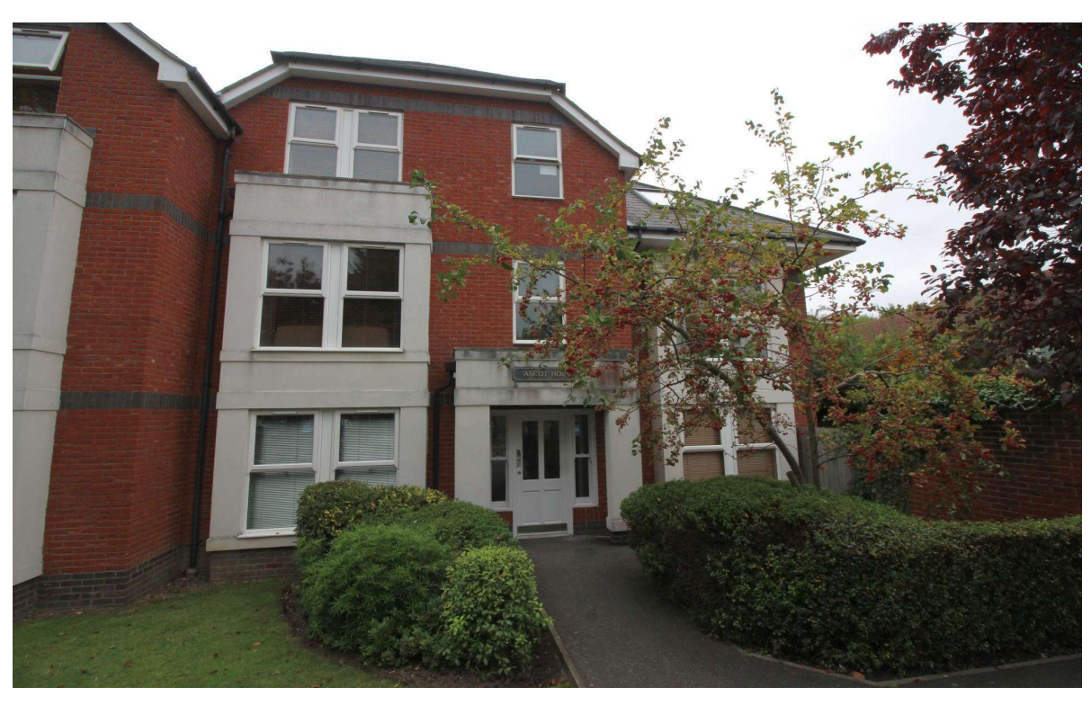
School Lane, Surrey, TW20 9GF