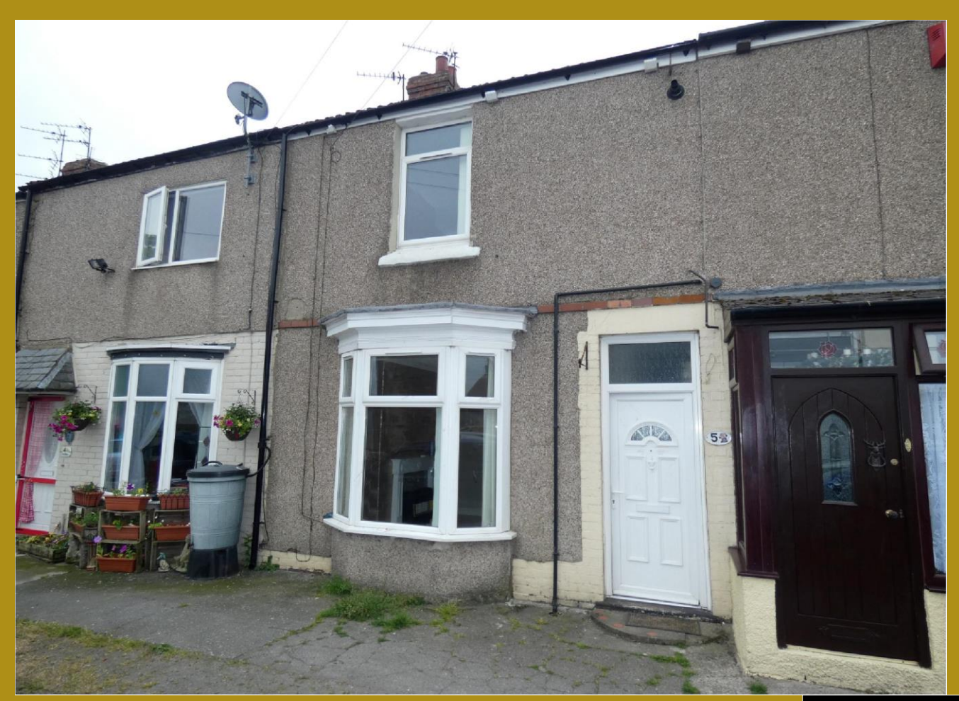
EPC Rating: D