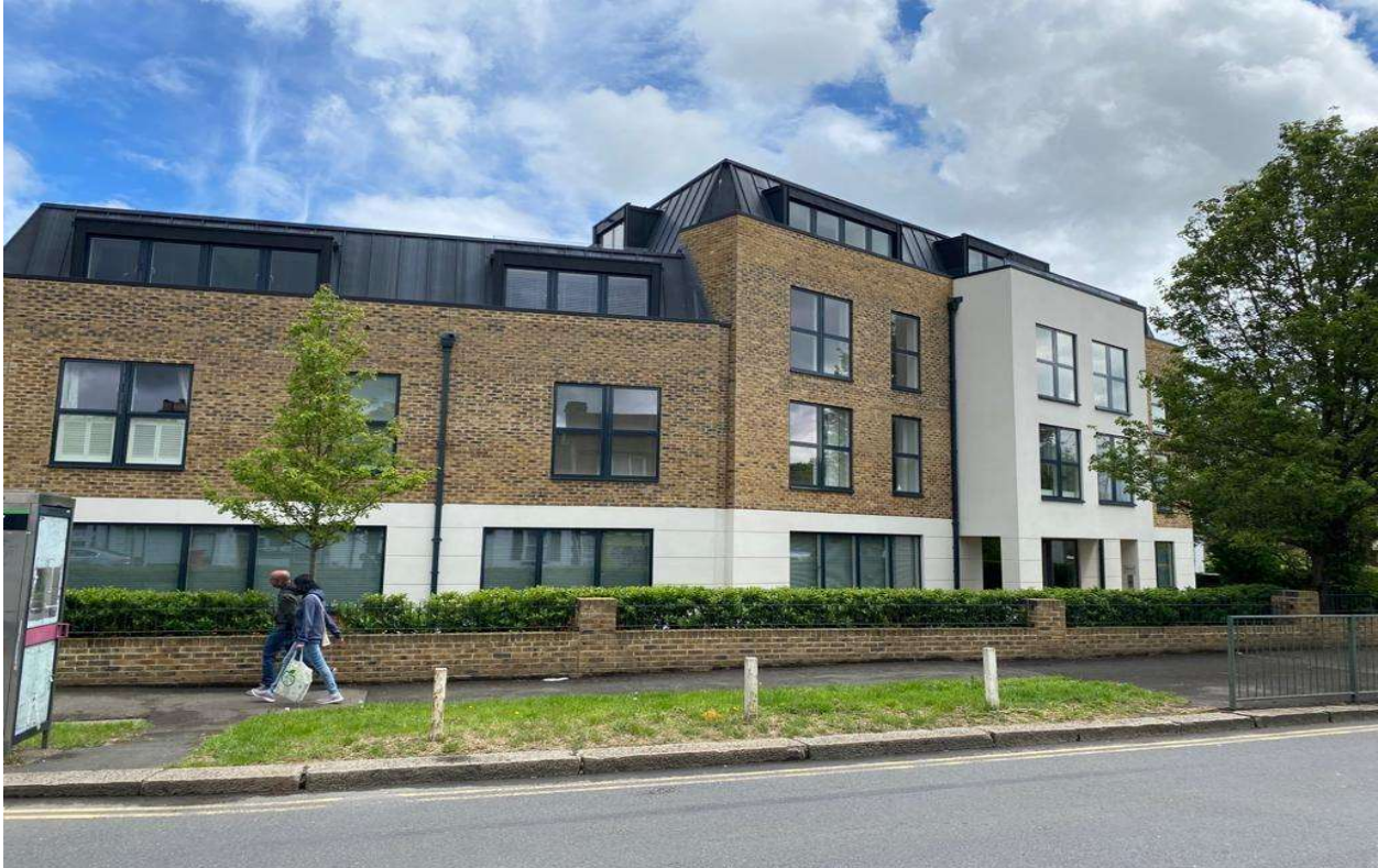
One High Street, Egham, Surrey, TW20 9HH £1,800 pcm Guide Price