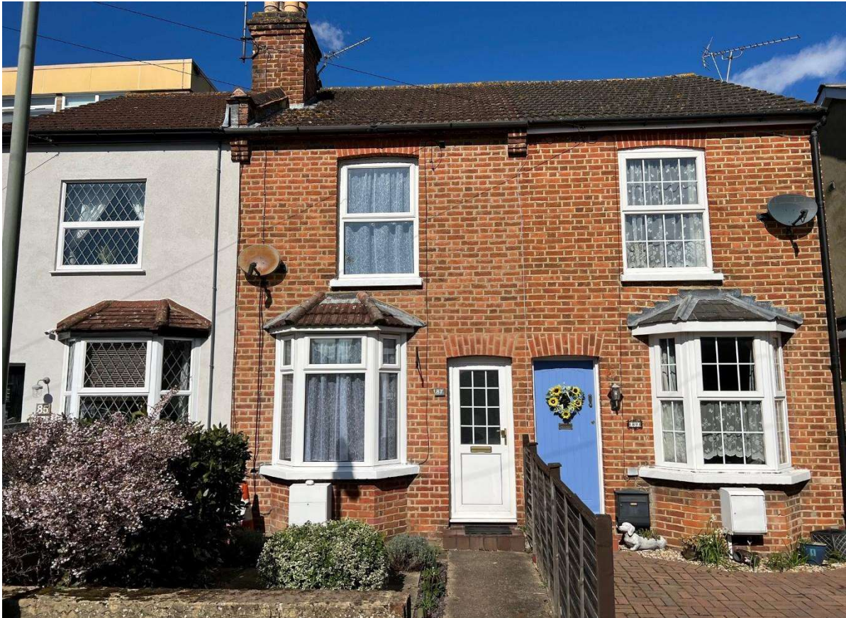
Edgell Road, Staines, Middx, TW18 2EN