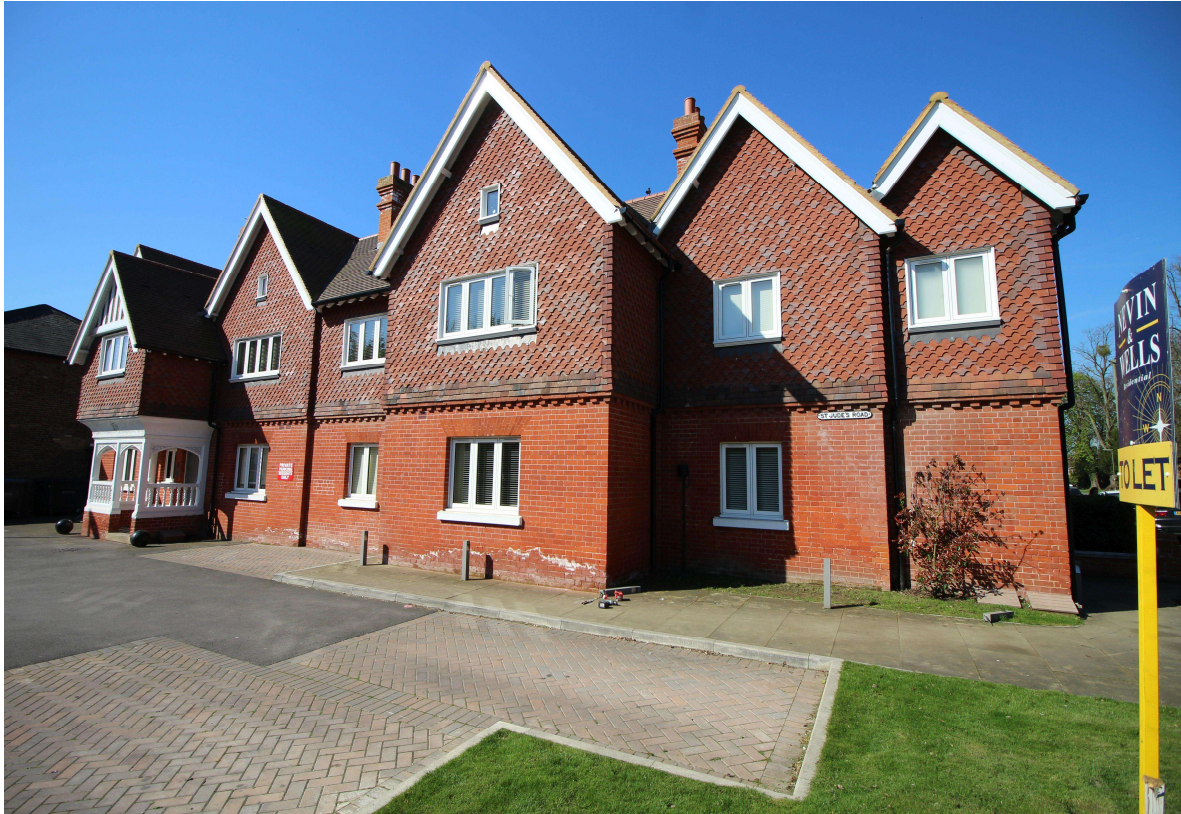
St Judes Road, Surrey, TW20 0DF