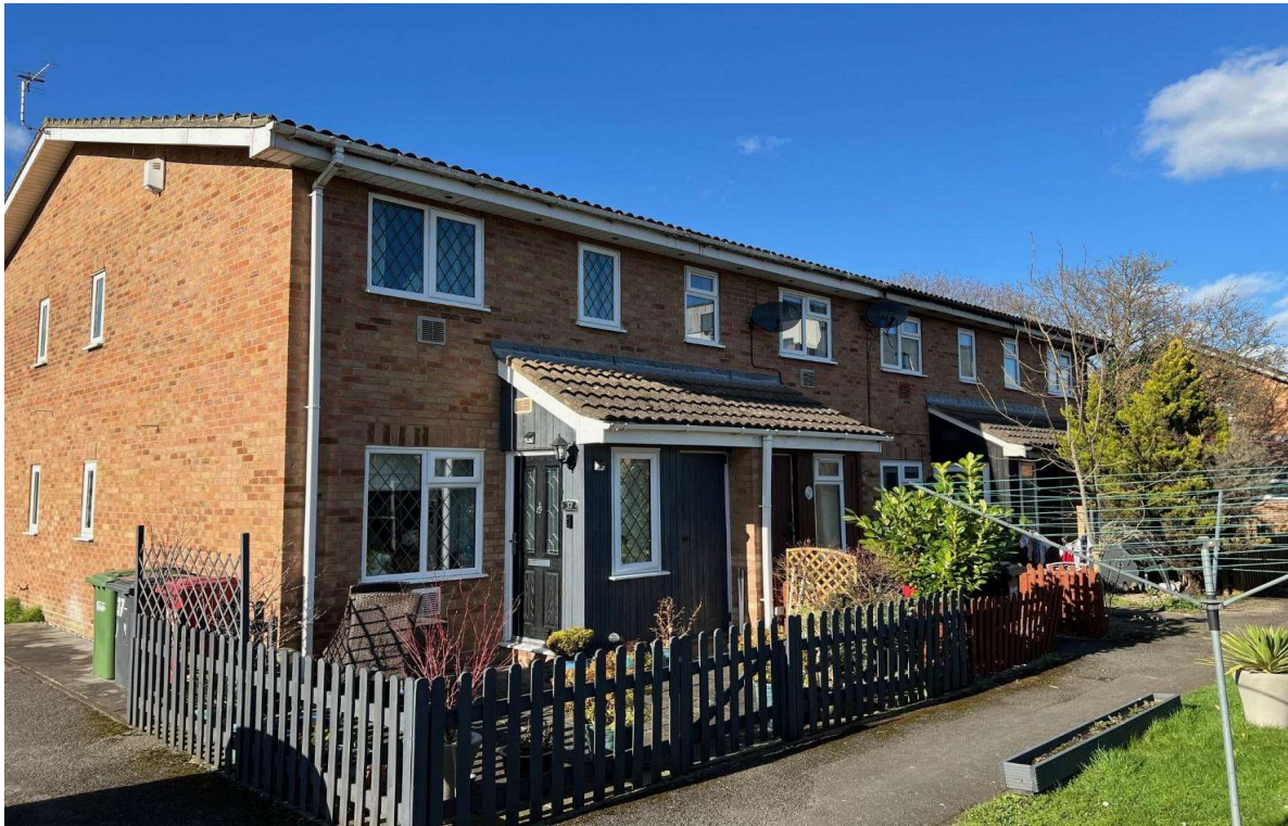
Meadowbrook Close, Colnbrook, SL3 0PA OIEO £265,000 Freehold