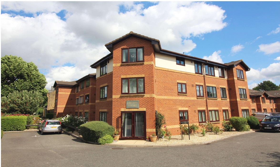
Orchid Court, Albany Place, Egham, TW20 9HA £135,000 Leasehold