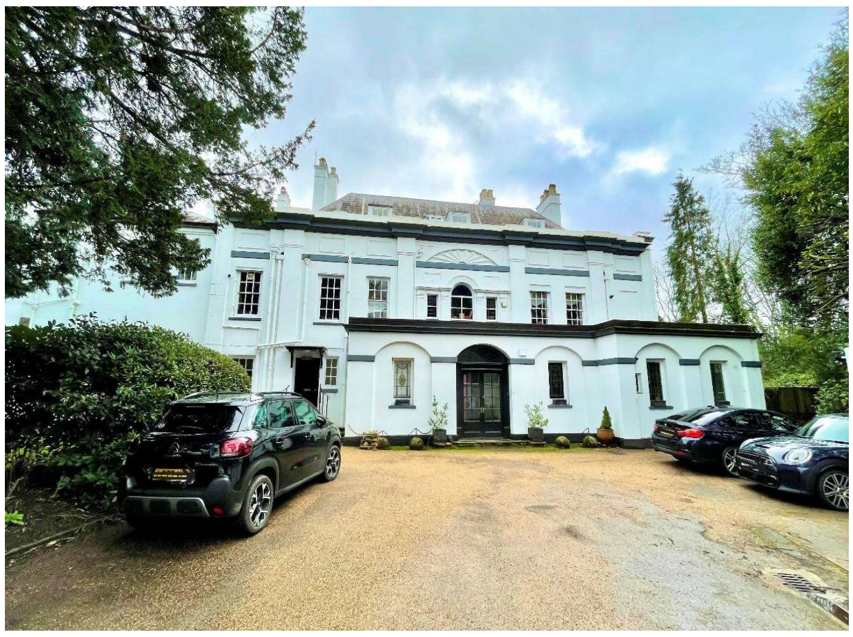
Clarence Lodge, Egham, TW20 0NW