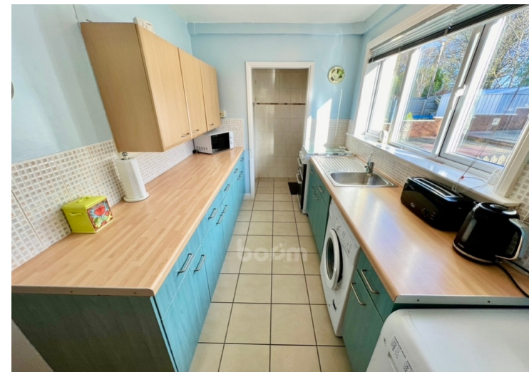
12 Walnut Crescent, Johnstone