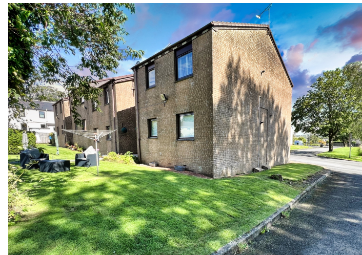
3 Kildale Road, Lochwinnoch