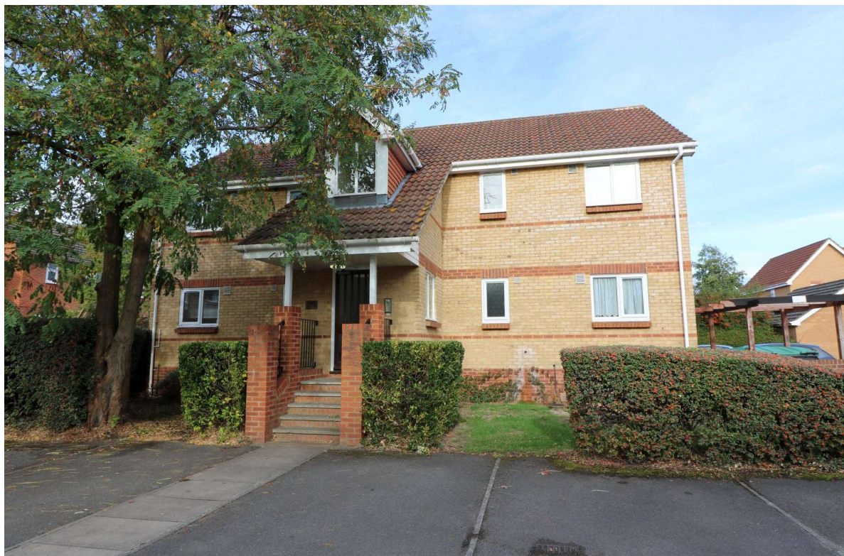
Mead Court, Surrey, TW20 8XF