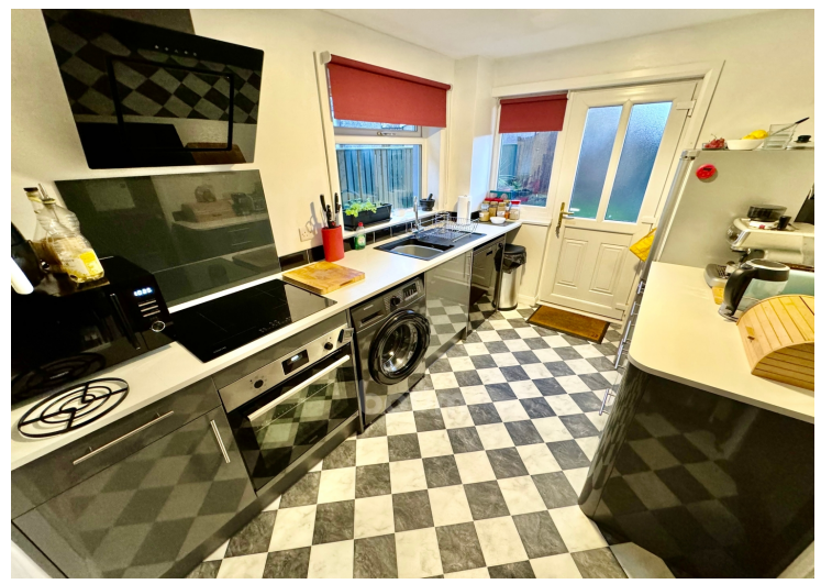
10 Trinity Crescent, Beith