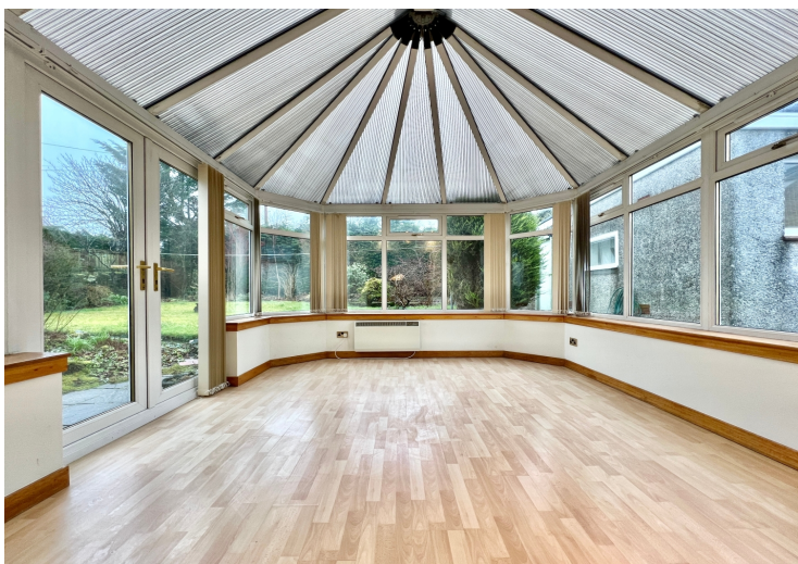
8 Ladysmith Road, Kilbirnie