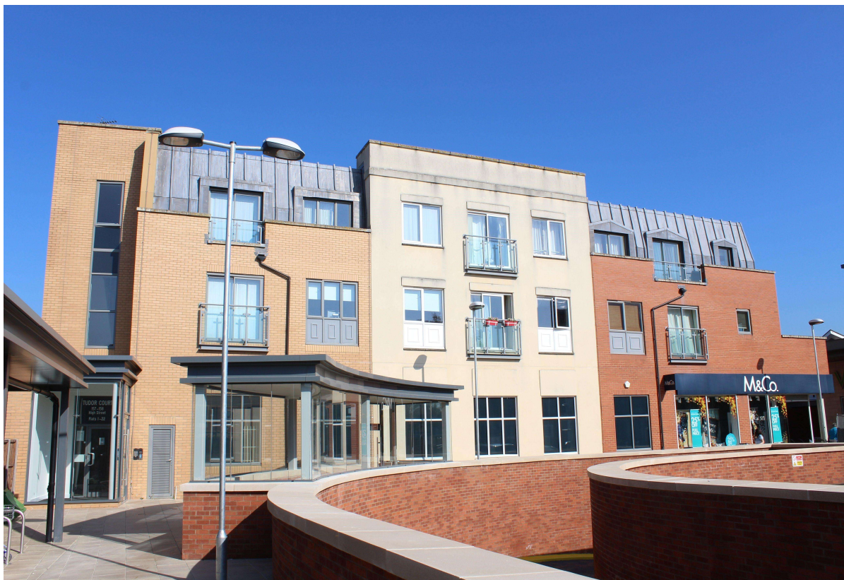
Church Street, Egham TW20 9HZ